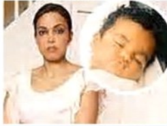
• Social workers snatched me from the white parents I loved to...