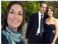
• Bride-to-be, 32, dies of ovarian cancer 90 minutes before...