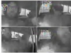
• 'Will you let me go?' Highly intoxicated man sings perfect...