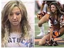
• Cincinnati Bengals cheerleading captain and ex-teacher...