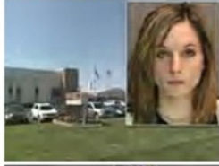
• Former Baptist school teacher, 25, 'had sex with male...